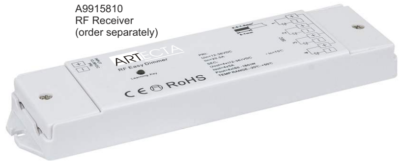
A9915810 RF Receiver (order separately)

Input Power: 12V-36V DC Output: Constant Voltage Max. load: 4x2A (2x4A) 2x 96W@24V 4x 48W@24V Operation Frequency: 434Mhz/868Mhz Range: 10-15 mtr Ta: -20° - +50° Tc: +75° Dimension L x W x H (mm): 178 x 46 x 19 Weight: 0.09 Kg Protection: IP-20 Class II Approvals: CE / FCC / RoHS