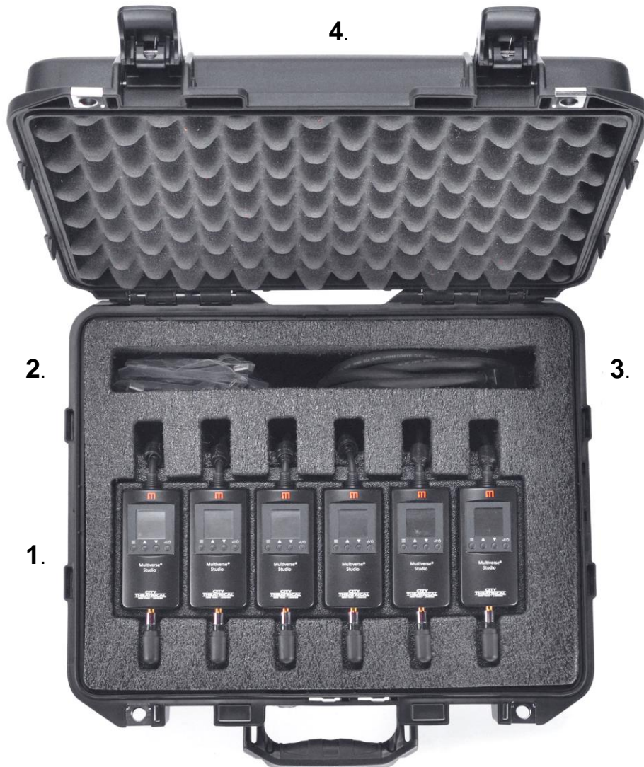
Figure 1: What's Included