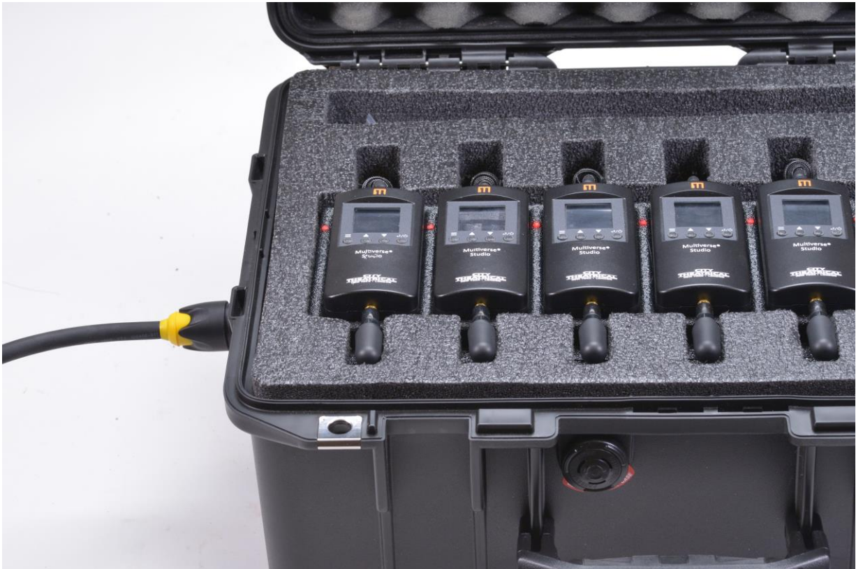
Figure 2: In-Case Charging