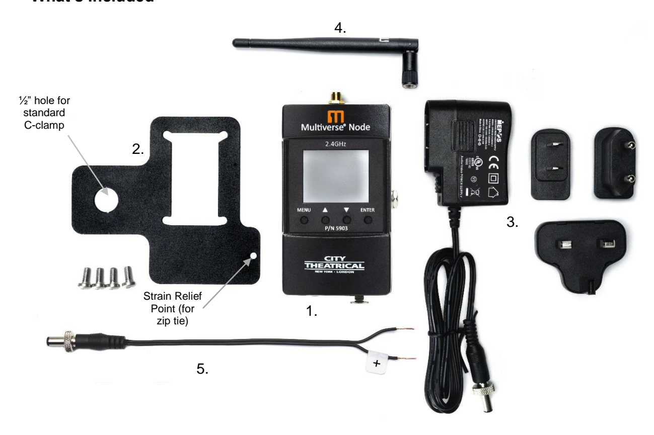
Figure 1: What's Included