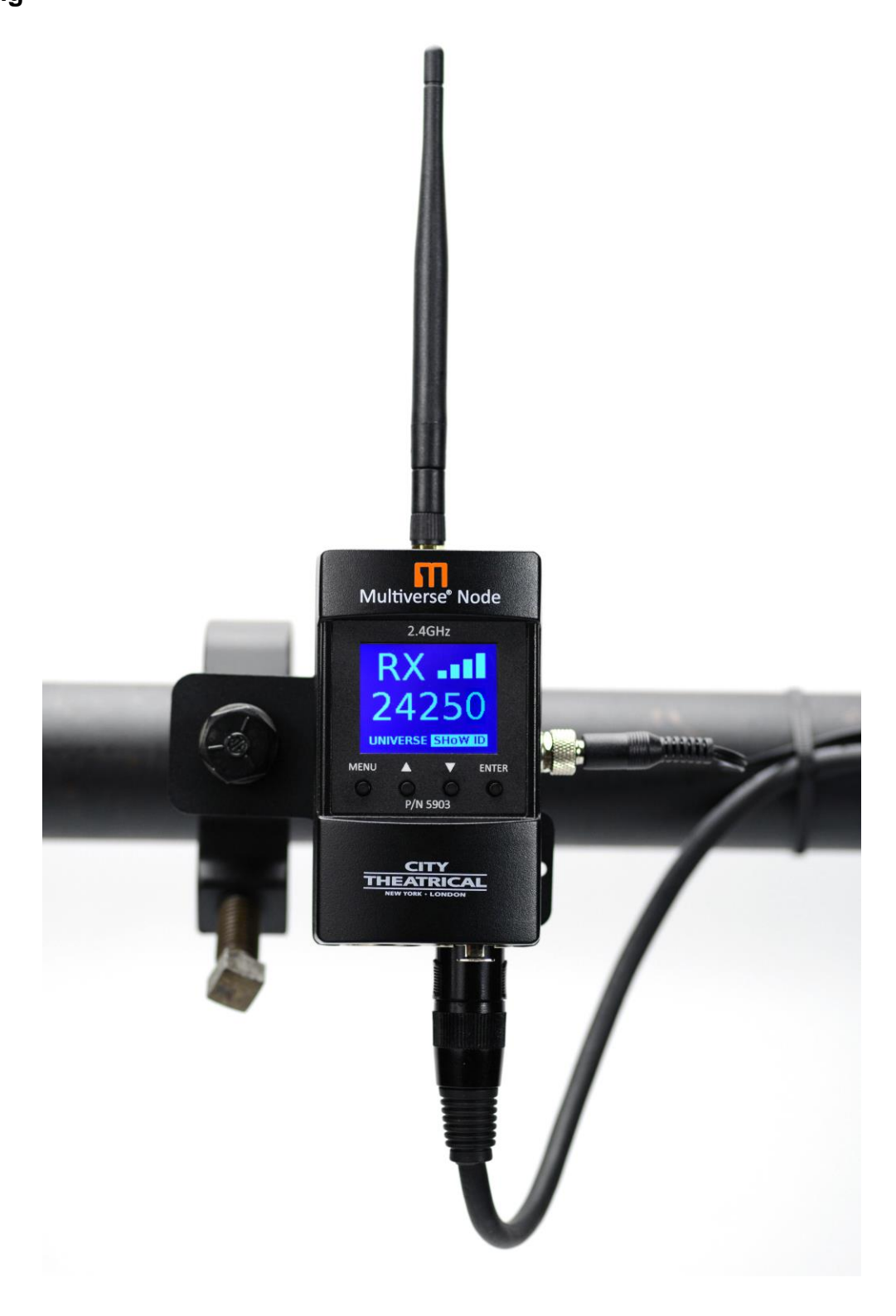
Figure 3: Pipe Mount