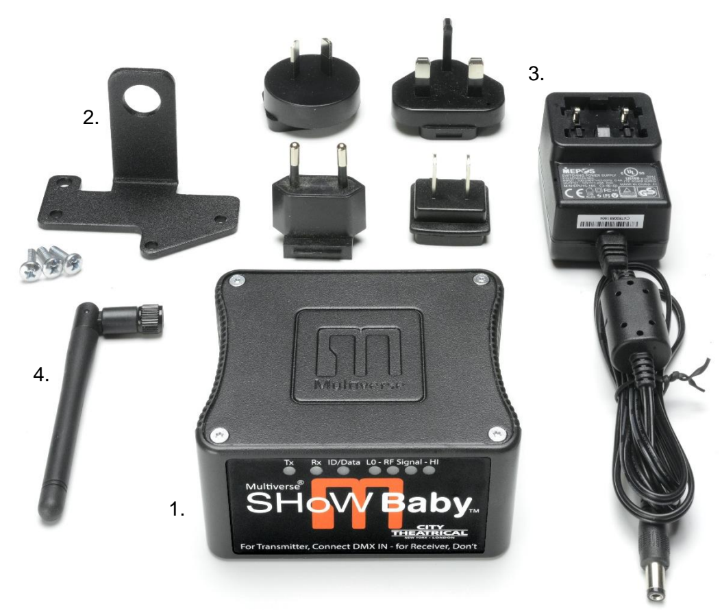
Figure 3: What's Included