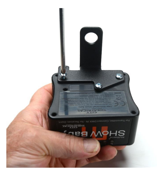
Figure 2: Attaching the Mounting Bracket

Mount the Bracket on the Multiverse SHoW Baby using the three provided 8-32 x 1/2" pan head Philips screws.